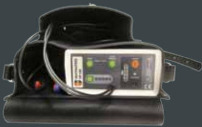
HM190 T/C attachment unit including leather case