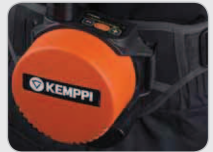
The comfort belt mounts the battery powered FreshAir filter pack and also provides additional back support throughout the working day.