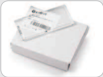
Optical magnifying lenses can also be fitted for improved visibility and close, low current work.