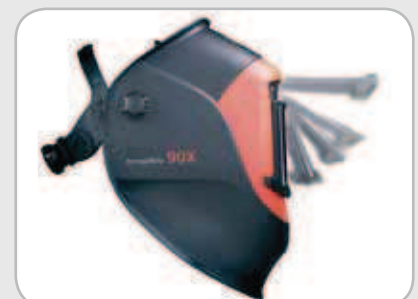
Pivoting filter glass including 'peep' position. Particularly useful with KemppiBeta 90 standard model.