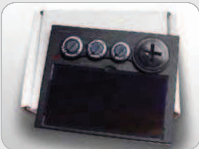
Kemppi auto darkening welding filter ADF 710S (9873058) can be fitted to Beta 90 FreshAir, Delta 90 FreshAir and Delta+ 90 FreshAir. Kemppi auto darkening welding filter ADF 200F fixed shade EN11 (9873059) is fitted to Beta 90 and Delta 90 FreshAir as standard.