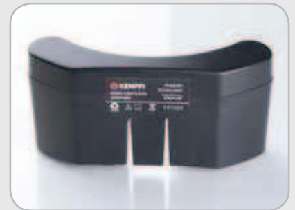
The rechargeable NiMH 4.8/4.5Ah battery lasts up to 10 hrs of operation. Purchasing a second battery ensures you always have a back-up power supply ready charged.