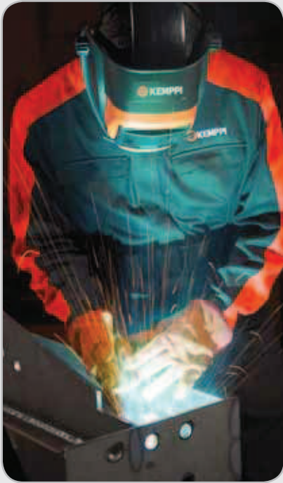
Kemppi FreshAir welding respirators provide an economic solution for high level personal protection.