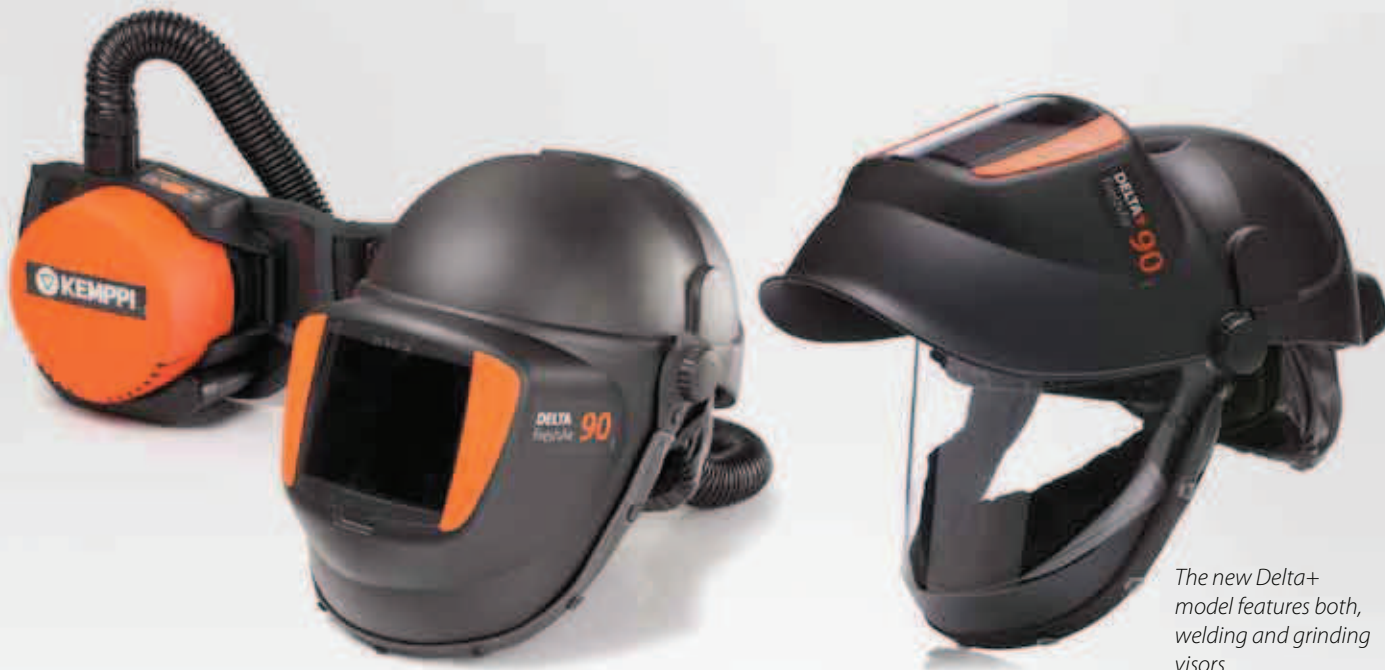
The new Delta+ model features both, welding and grinding visors.