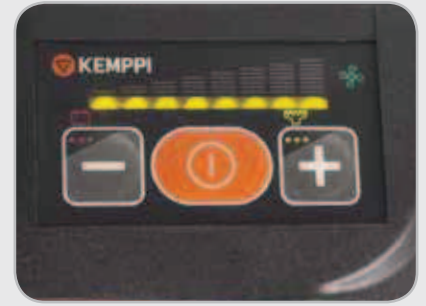
FreshAir flow control filter pack automatically regulates the fan motor speed to compensate filter clogging and battery state.

FreshAir PRESSURE Conditioner is an in-line filter station designed for improving the quality of supplied air. The strong metal pressure container incorporates a high capacity combined filter. The FreshAir PRESSURE conditioner removes particles and unpleasant odours from airline supply systems, substantially improving the quality of the breathing air. The quick couplings allow single-handed assembly of the device and the outlet connection is prepared for two operators. A standard pressure gauge measures the outlet pressure.