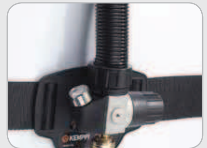
FreshAir pressure flow control valve regulates supply air flow and includes an air supply monitoring gauge