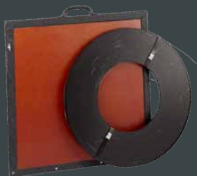
Steel band and the case