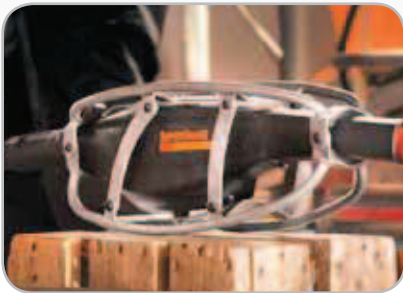
The sturdy steel frame effectively protects the SuperSnake from worksite hazards, such as blows and crashes.