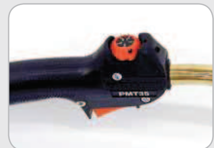
When connected with Kemppi FastMig equipment, SuperSnake is compatible with the RMT10 Gun remote control, making real-time power management or remote channel selection easy and convenient.