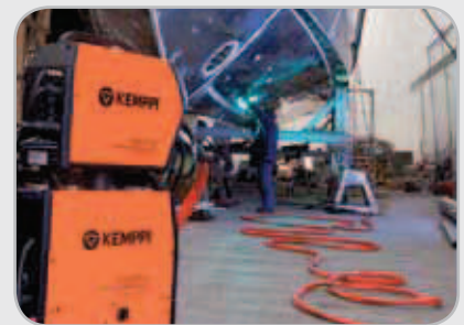
Traditional motor pistols and spool gun designs increase weight and strain on the operator's wrist and are limited by their distance, filler wire, or volume welding capability. The SuperSnake GT02S resolves all of these issues, while reducing the weight and strain on the operator's wrist by using standard welding guns.