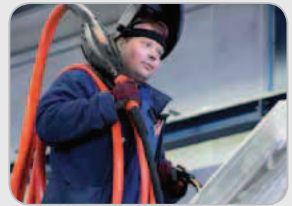
Liberate your welding team by giving greater freedom of movement.