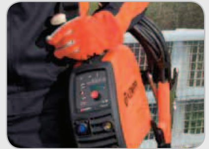
Lightweight, compact and super portable

* The AU model is for the Australian and New Zealand markets, DK model for Denmark. They have different mains plugs.