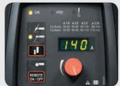
Large and clear meter display