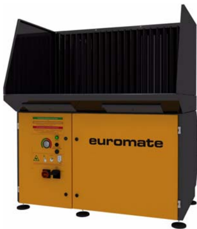
Shown: downdraft table with backdraft kit and side panels